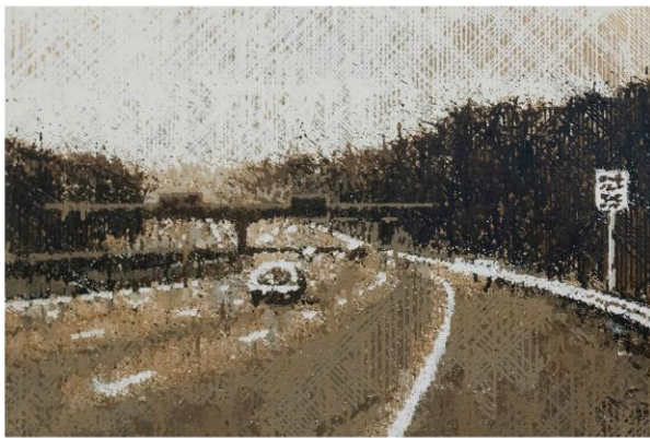
495 South (1970)