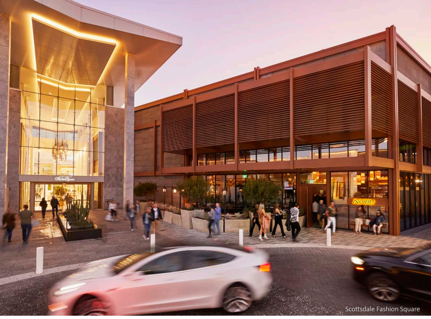
Scottsdale Fashion Square