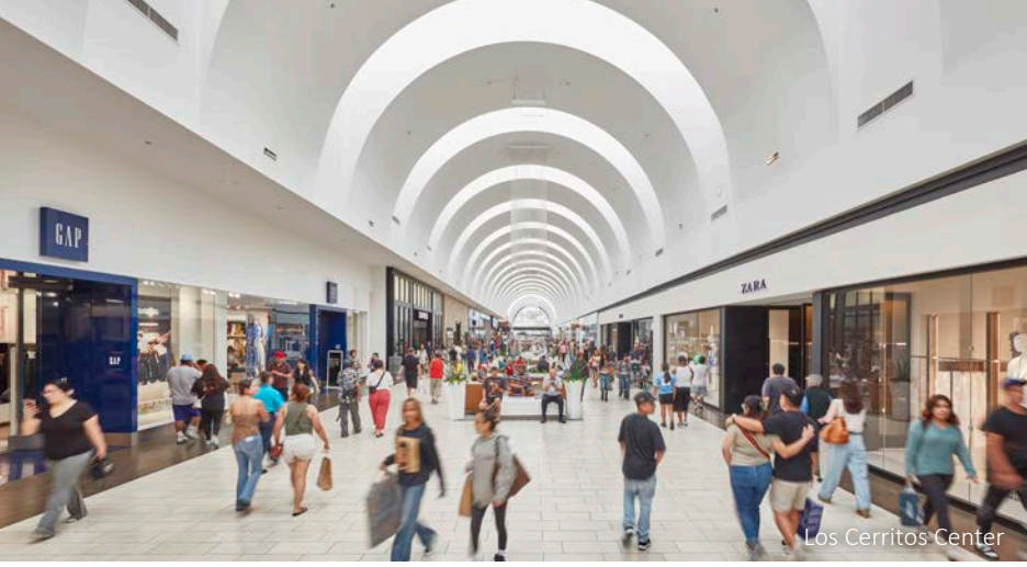
Los Cerritos Center