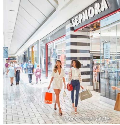
Tysons Corner Center