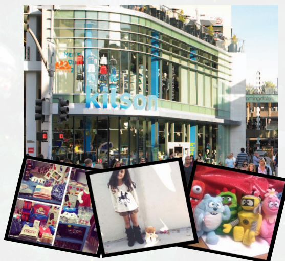
Kitson Holiday Toy Shop (2nd level, Kitson Store) From stylish clothes to unique games and gadgets, Kitson Holiday Toy Shop has a creative selection for you to wow the little ones with gifts from Santa.