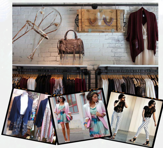
Keene L.A. and Free People For the free-spirited beach/city girl, she'll love these trendy boutiques where classic East Coast looks meet laidback California cool.