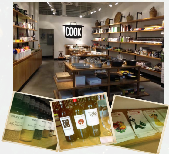
COOK by Venokado Offering specialty cookware, utensils, ingredients, and one-of-a-kind pieces, COOK will make chefs of all skill sets race for the kitchen.