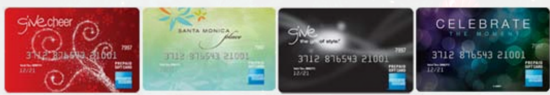
Santa Monica Place Holiday Gift Cards Give the gift of choice and cheer. Santa Monica Place gift cards are redeemable wherever American Express Cards are accepted. Holiday Cheer Card available at Santa Monica Place only through Dec. 24. While supplies last. Terms and conditions apply.