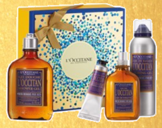
L'Occitan Star Gift $69 ($96.50 Value) Perfect Gift for Him