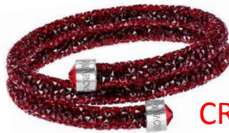
CRYSTAL DUST BANGLE Find at Swarovski