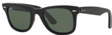
RAY-BAN ORIGINAL WAYFARER