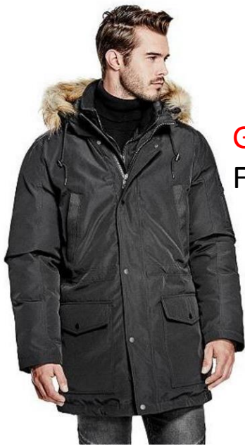
GEOFFREY HOODED PUFFER COAT