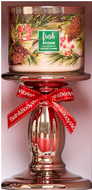
CANDLES, SIGNATURE COLLECTION + MORE Find at Bath & Body Works