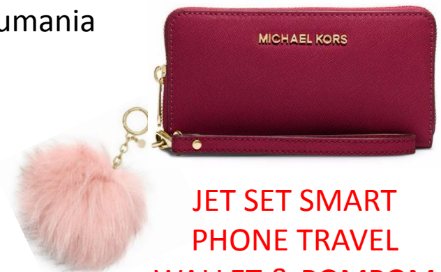
JET SET SMART PHONE TRAVEL WALLET & POMPOM KEY CHAIN Find at Michael Kors