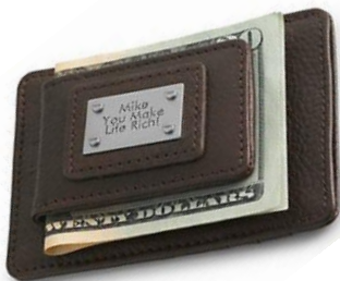
BROWN LEATHER MONEY CLIP WALLET Find at Things Remembered