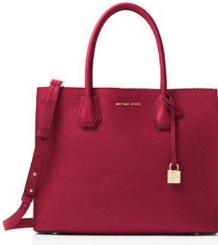
MERCER CONVERTIBLE TOTE Find at Michael Kors