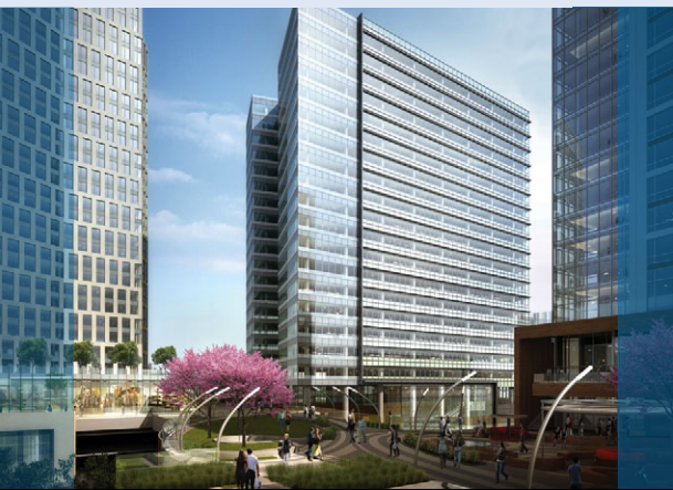
Tysons Corner Center