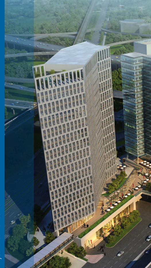
Tysons Corner Center

This summer's big news – now that Washington, D.C.'s Metrorail Silver Line is under construction – is that Macerich has built a team with best-in-class development specialists in hotel, office and residential to transform Tysons into a fully connected, transit-accessible community where people will work, shop, dine and live.